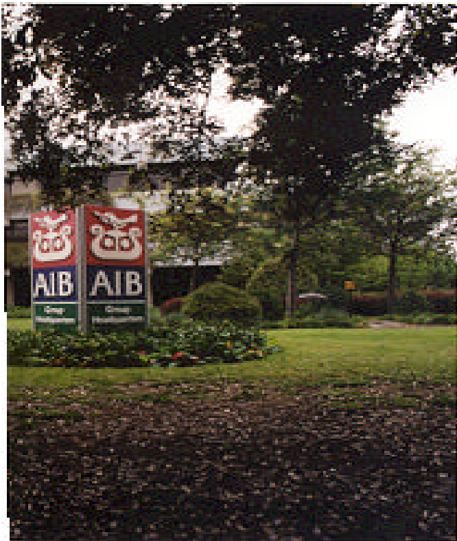
AIB Corporate Banking – AIB Corporate Headquarters, Ballsbridge, Dublin, Ireland

AIB Corporate Banking wanted to implement a budgeting/ planning system and customer profitability analysis. Codec enabled AIB spend more time on analysis and adding value to the business. Benefits outlined include; elimination of paper reports, more timely and accurate management information, much improved capability for analysing information and reduced production times for actual reporting and budgets.